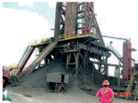
Massive sand production in a field in Indonesia